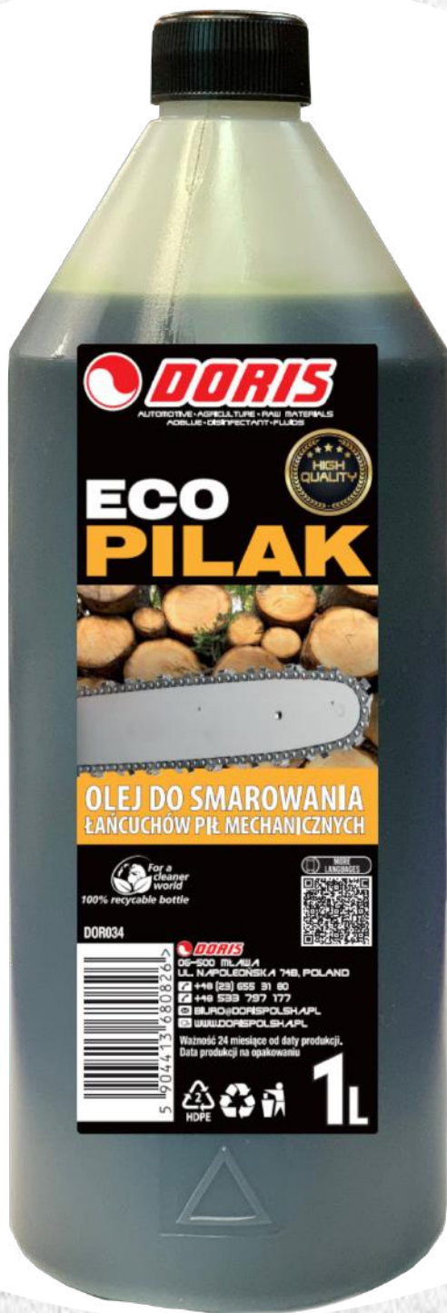
Oil for lubricating the saw chain PILAK 1L