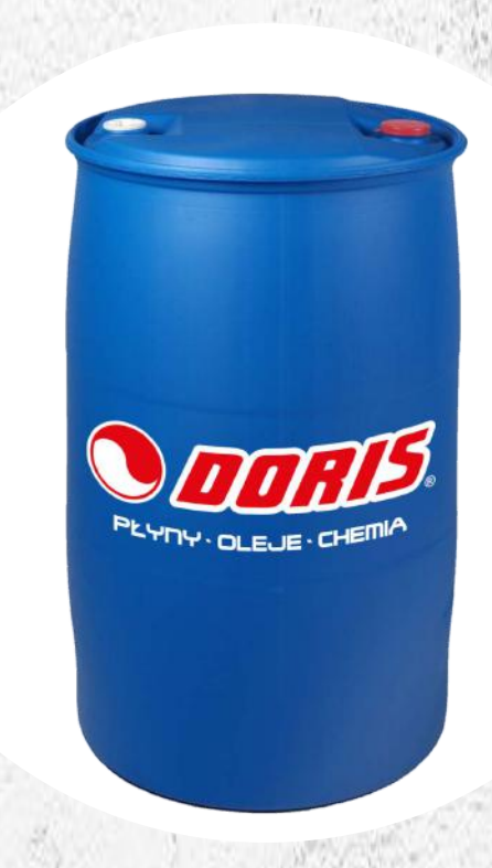
Products in plastic barrels