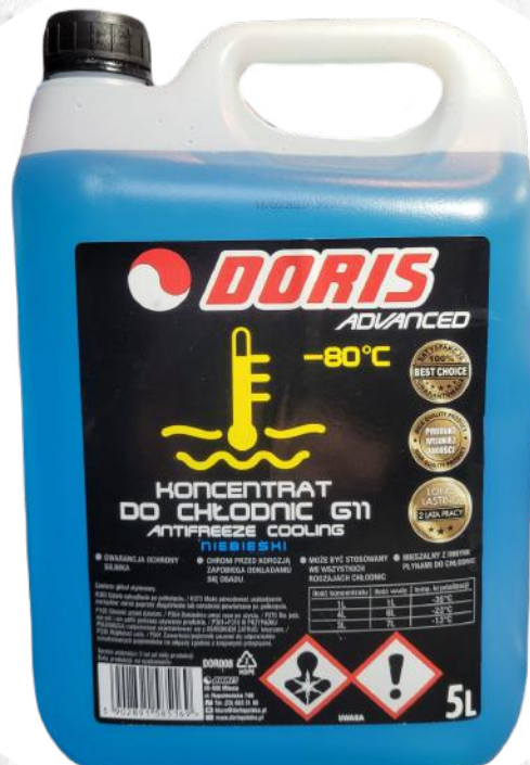
Blue Cooling Concentrate G11 -80°C (5L) STD