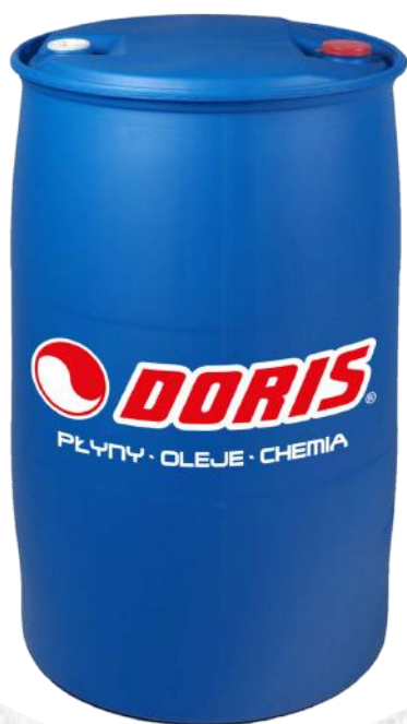
Products in plastic barrels