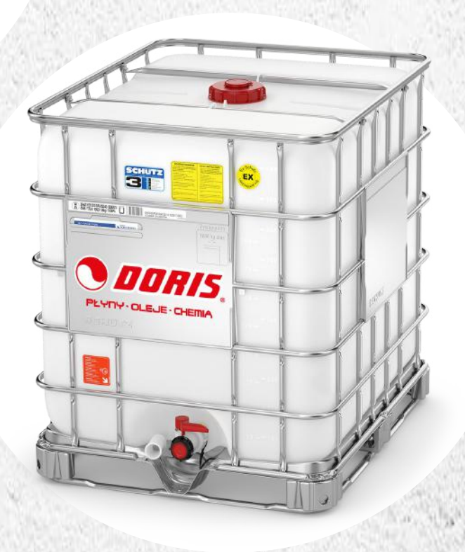
Products in IBC containers