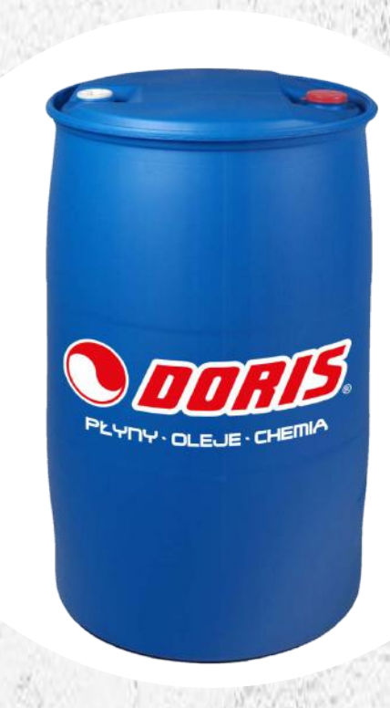
Products in plastic barrels