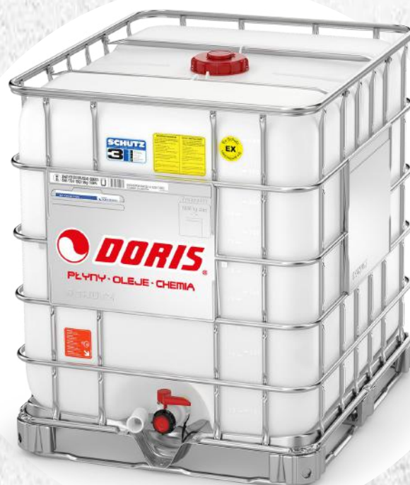
Products in IBC containers