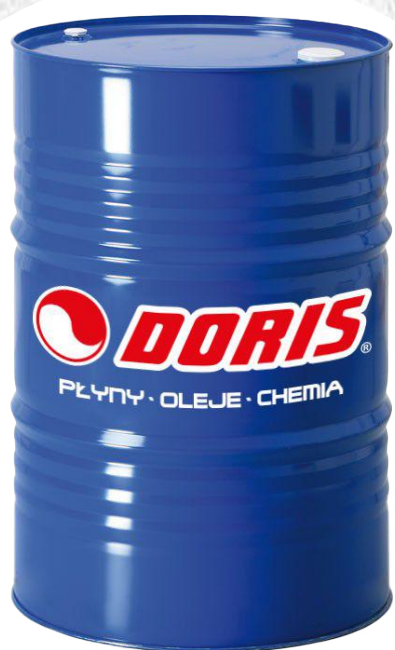
Products in metal barrels