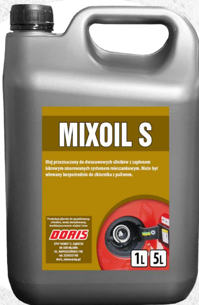
Engine oil MIXOIL 5L STD