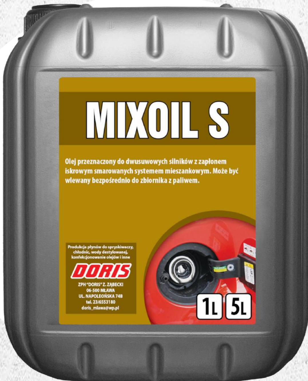
Engine oil MIXOIL 5L KWR