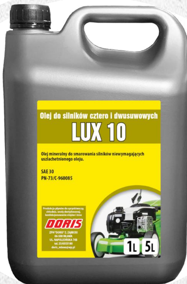
Engine oil LUX 10 5L STD