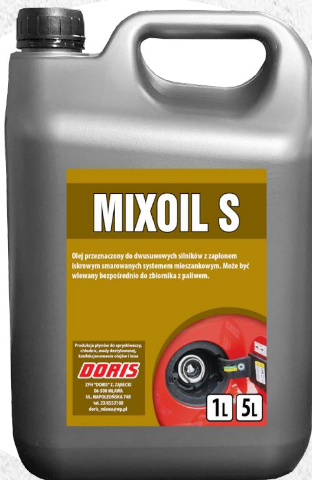
Engine oil MIXOIL 5L STD