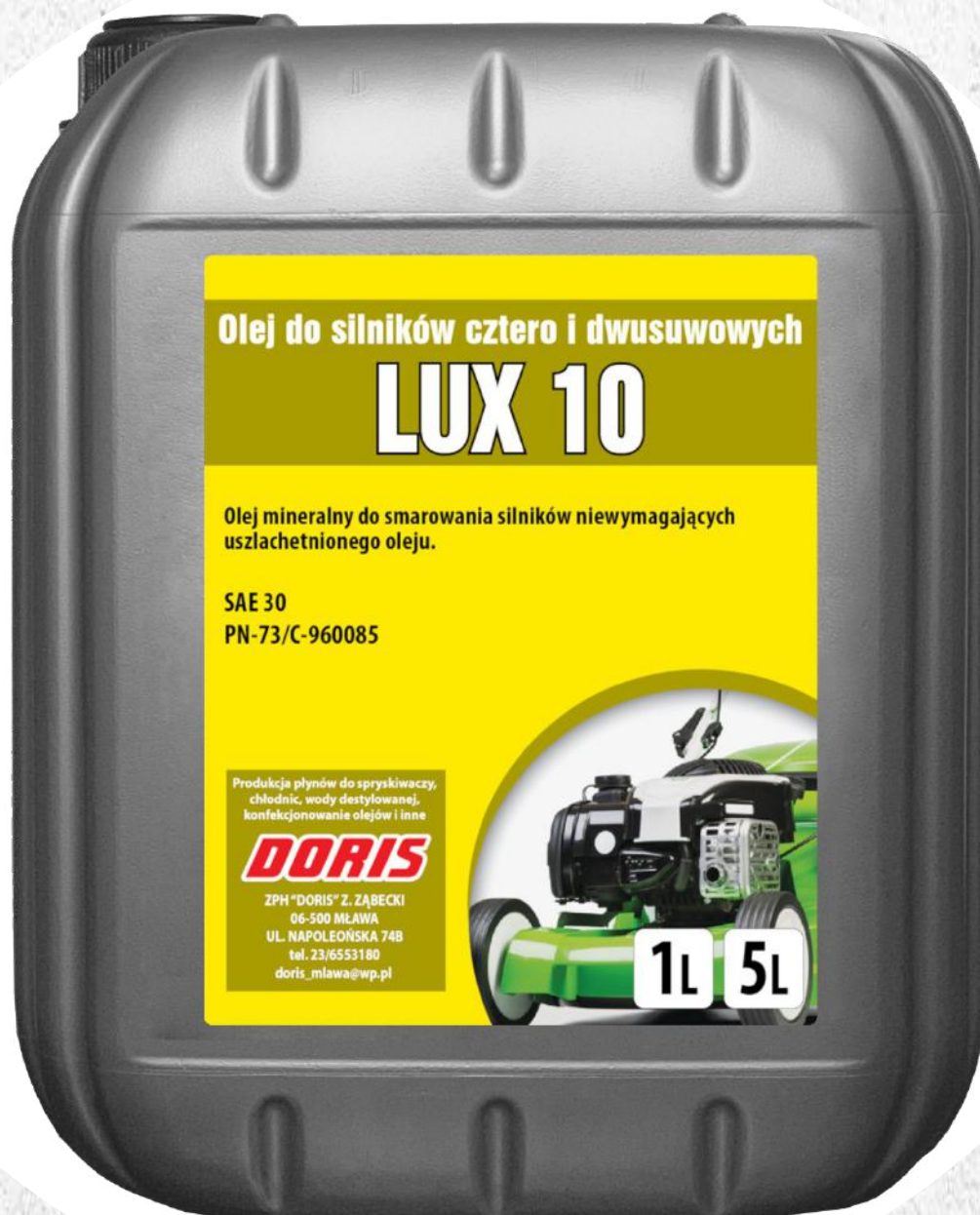
Engine oil LUX 10 5L KWR