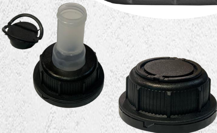
Engine oil MIXOIL 5L KWR-ZLK