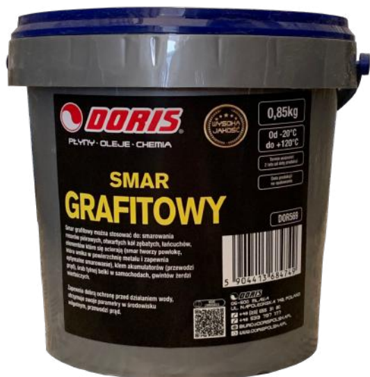
Graphite Grease 0,9kg