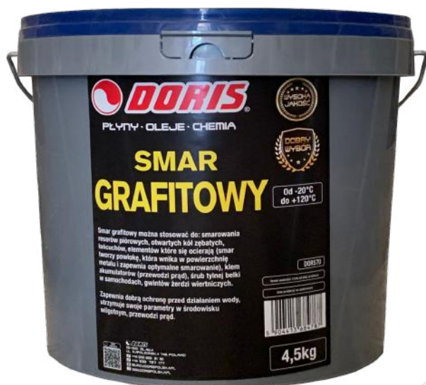
Graphite Grease 4,5kg