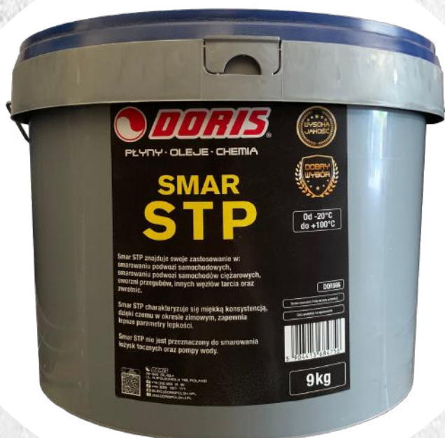
Grease STP 9kg