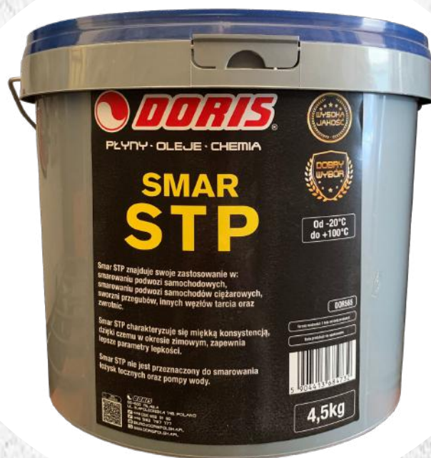
Grease STP 4,5kg