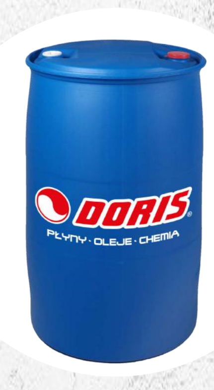
Products in plastic barrels