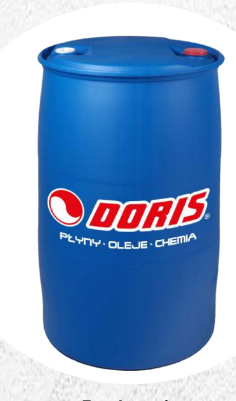
Products in plastic barrels